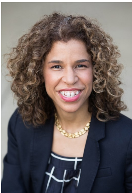
School Board Member, 3rd District