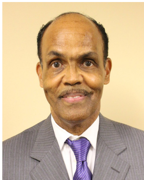
Director of High School Principals